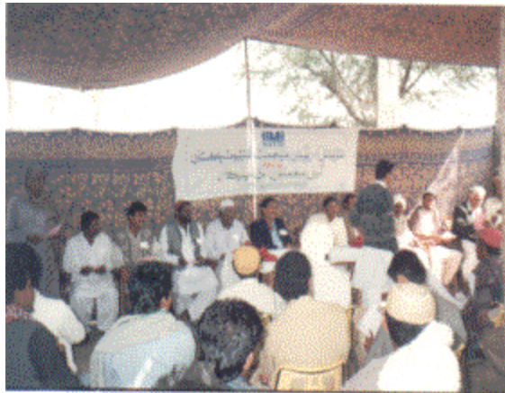
Photo 4. Organizational Management Training.

In the first phase of the project, IWMI field team had encountered several problems while organizing the new farmer organizations at pilot distributaries. The water users were told that the distributaries are being privatized, meters would be installed on the outlets and price of irrigation water would be very high, and so on so forth. In fact the lower level irrigation officials spread these rumors. Learning lessons from past, awareness training workshops were organized at various places for IPD officials. The training workshops to IPD officials resulted in no resistance, rather they were supportive to the field team. Subsequently